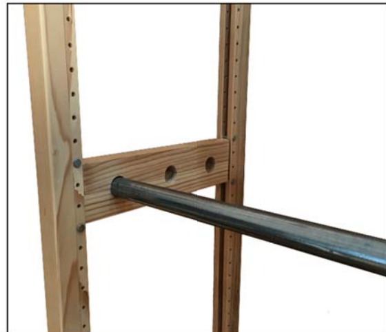
Set top wood rail and secure with additional pins

Our Hang Bars are Commercial Grade for incredible strength!